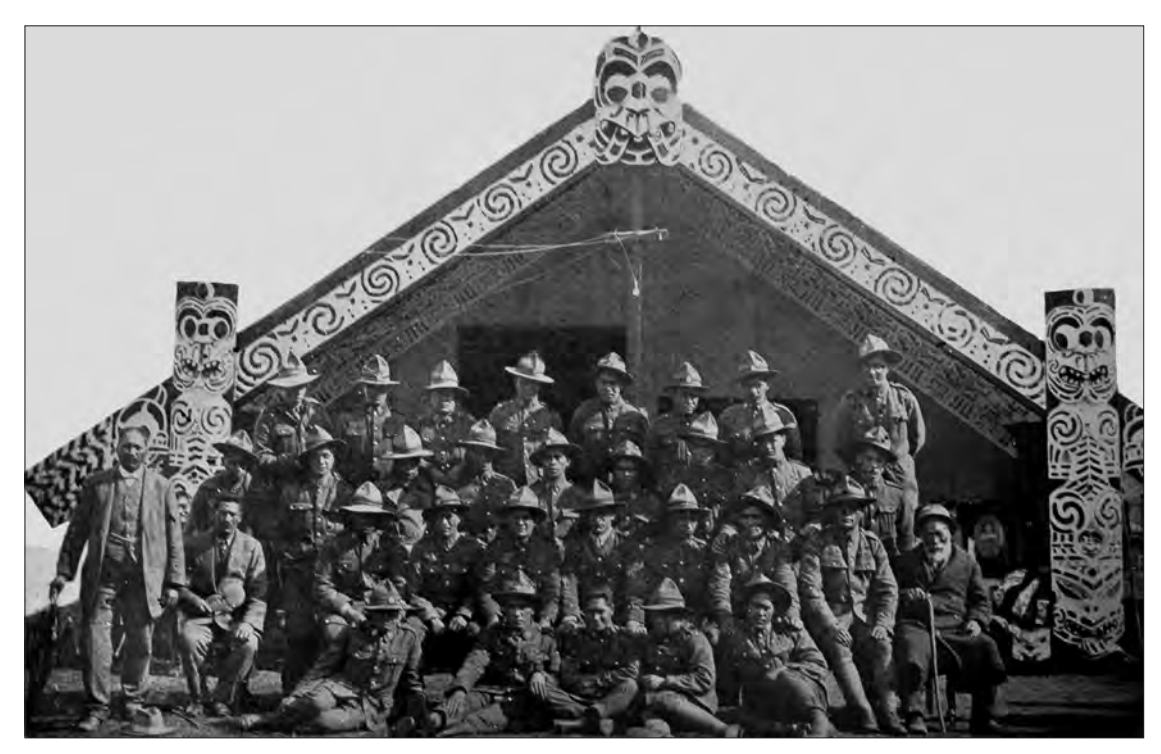
A group of Ngati-Tuwhareta soldiers.