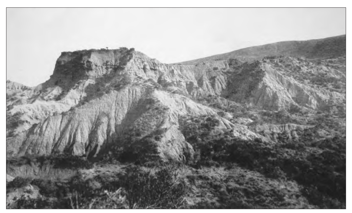
Little Table Top.

we could. There was a captured machine-gun in the trench. Came down, saw the Canterbury stretcher-bearers, and located Captain Guthrie, who had established an aid post in the same gully but had been working the other ridge. Meanwhile Ghurkas and other troops were passing through the valley and passing inland. We went thoroughly over the ridge that we had partly done, and whilst exploring it for wounded we were nearly shot at by the Ghurkas; the General considered there was nobody on their left.